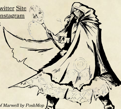
Prescott of Marwell by PoshMop

Worldbuilding.io Twitter Site PoshMop Twitter Instagram Homebrewery Site